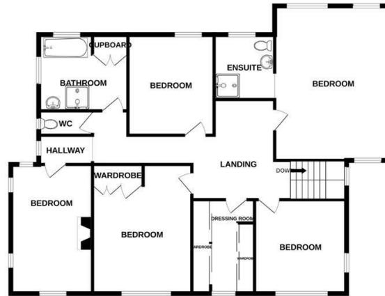
1 EATON ROAD, NORWICH

Whilst every attempt has been made to ensure the accuracy of the floorplan contained here, measurements of doors, windows, rooms and any other items are approximate and no responsibility is taken for any error, omission or mis-statement. This plan is for illustrative purposes only and should be used as such by any prospective purchaser. The services, systems and appliances shown have not been tested and no guarantee as to their operability or efficiency can be given. Made with Metropix ©2025